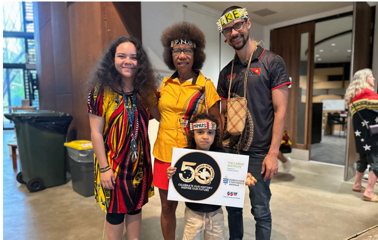
The Cairns Institute at James Cook University received a Spark Grant to host an event celebrating Papua New Guinea’s 50th Anniversary of Independence

Applications take 15 minutes and eligible recipients are selected through a conditional random ballot, ensuring equity and transparency with events supported across Australia and online.